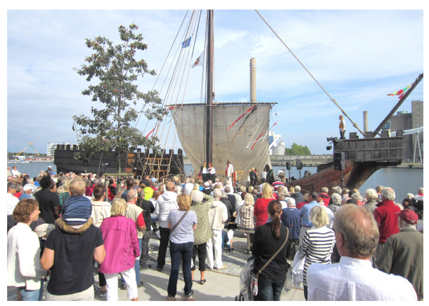
The two hour long song and music event held in the afternoon at Ön in Limhamn, Malmö.

As an aside the Swedish Tax Agency has pointed out that a Swedish museum must be contained only in a singular building (!) and may only hold display cases containing