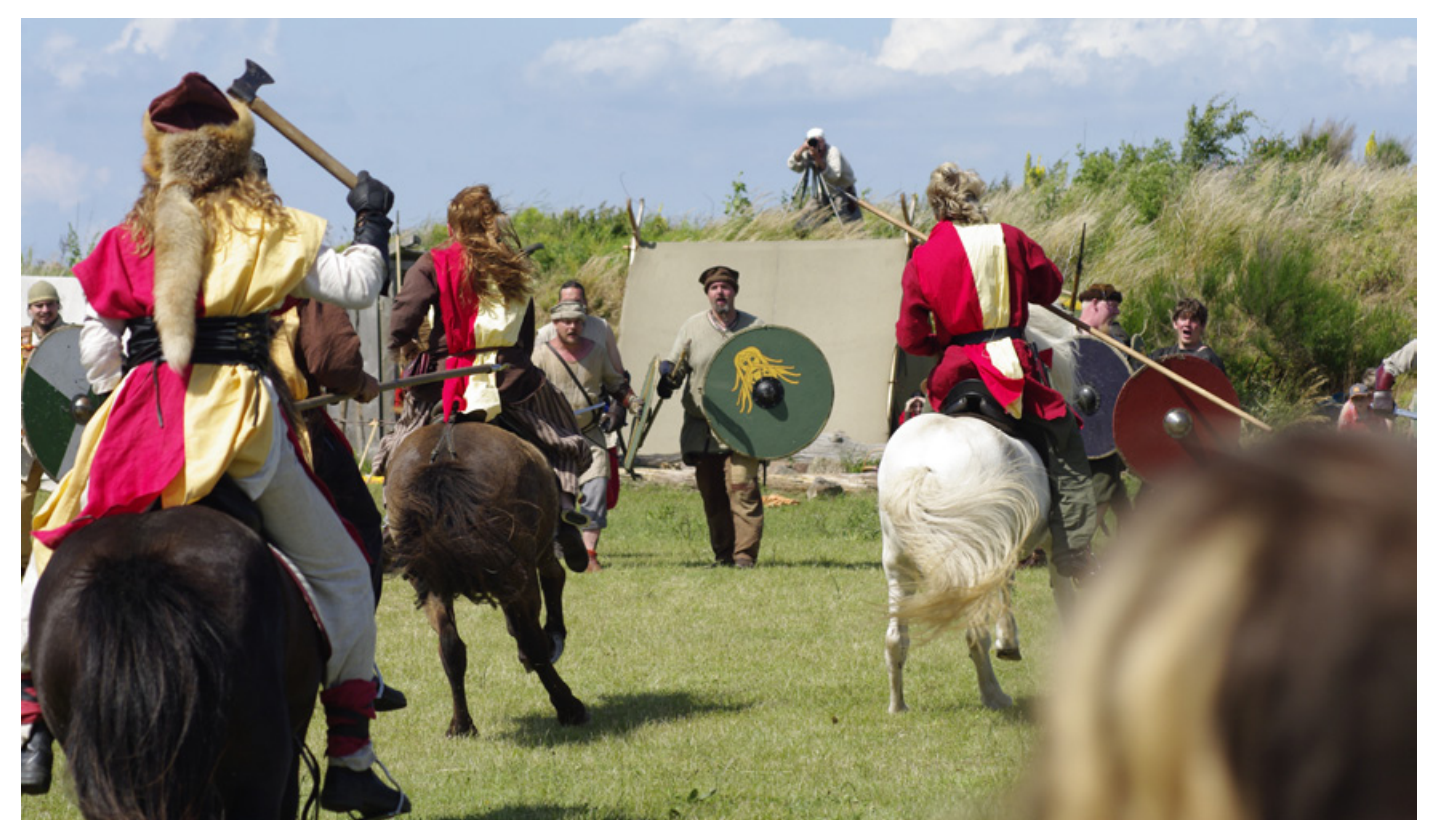
To the delight of the onlookers a cavalry charge occured during the re-enactment of the large battle at Foteviken anno 1134.

old objects (!) Despite us being a museum according to the UN and European guidelines the Swedish state with their Stone Age views continue to object. To them our entrance shop and exhibition hall is Fotevikens Museum – to the rest of the world the Viking Town is the big part of the mu-