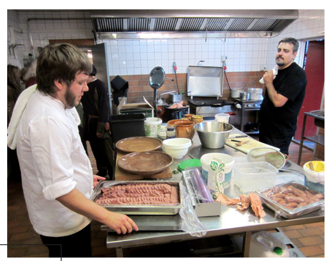
Food is important to Scania and large international museum conferences. Fotevikens Museum obviously hires the best chefs around.

Or to conclude with the motto of Fotevikens Museum since the start in 1995: Culture is contact between people of all categories.